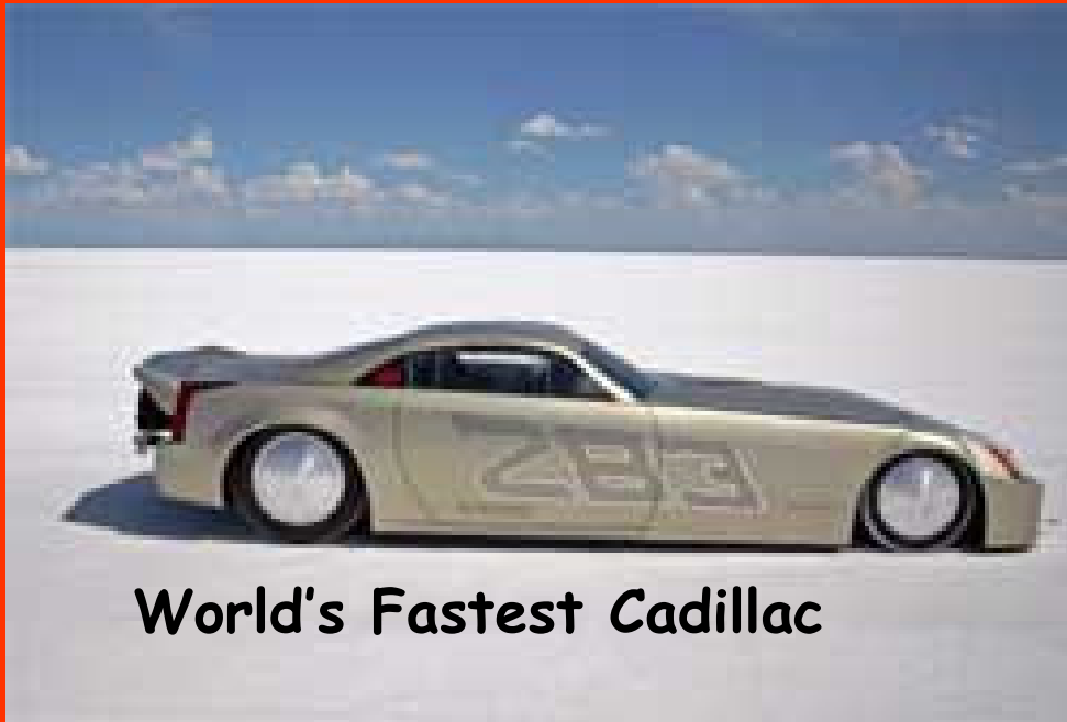
World's Fastest Cadillac

Cars have been going for the record at Bonneville ever since.