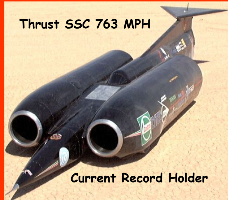
Thrust SSC 763 MPH