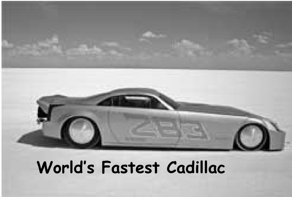
World's Fastest Cadillac

Cars have been going for the record at Bonneville ever since.