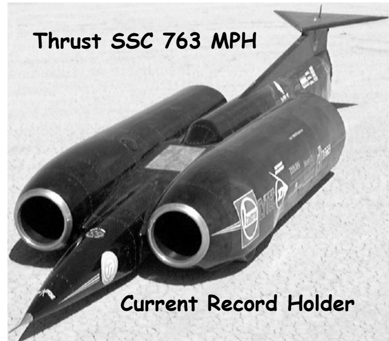
Thrust SSC 763 MPH